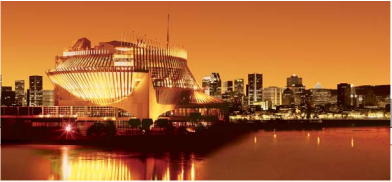
Casino de Montréal