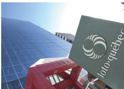
The Québec City regional office and building housing the Montréal head office were among the first establishments in the province to be certified by the Go Green program.

Finally, Loto-Québec's sustainable development initiative calls upon the contribution of the entire organization. Under the authority of the Senior Vice-Presidency of Communications and Public Affairs and integrated into the organization's strategic planning, this initiative took a significant step forward in 2005, marking the first phase of its implementation with the launch of a pilot project. The project will be carried out in seven phases.