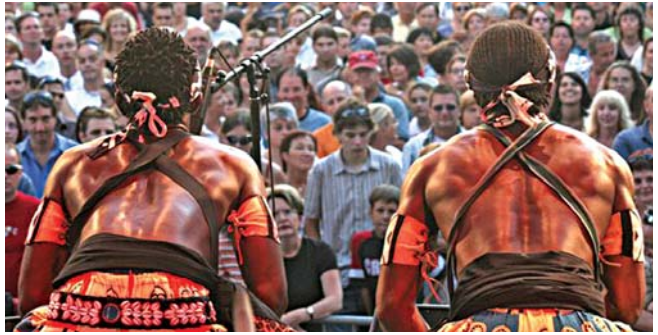
Festival international des rythmes du monde de Saguenay

Sponsorships of more than 100 public events across the province under the banner of Les Rendez-vous Loto-Québec and the Sorties signées Casino program, selected on the basis of their ability to generate economic spin-offs for the community and to attract tourists