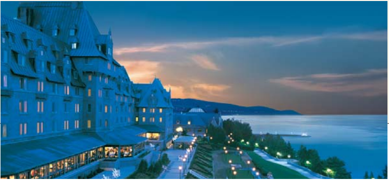
Casino de Charlevoix and Fairmont Le Manoir Richelieu Hotel