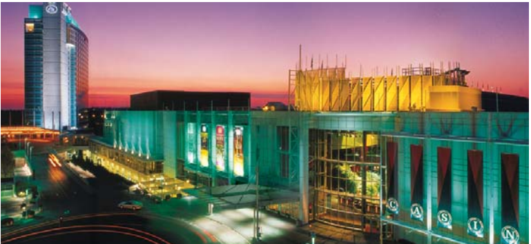
Lac-Leamy Complex: Casino and Hilton Hotel